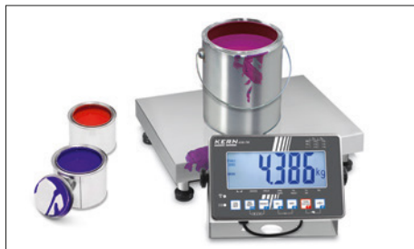
Durable stainless steel weighing plate