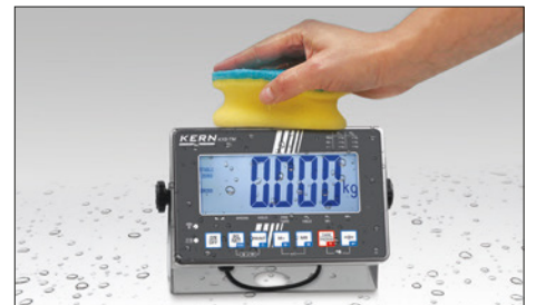
Stainless steel display device with IP68 protection , hygienic and easy to clean Benchtop stand incl. wall mount for display device as standard, for details see KERN KXS-TM